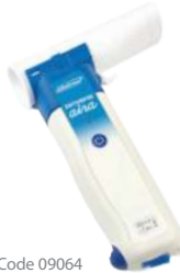
DATOSPIR aira DISPOSABLE