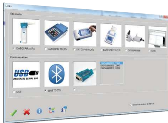
Compatible with all Sibelmed spirometers