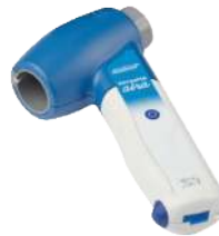
DATOSPIR aira FLEISCH