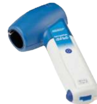
DATOSPIR aira TURBINE