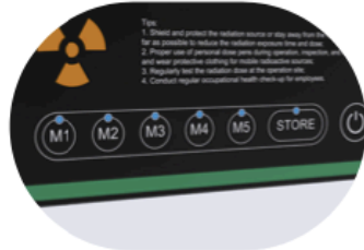
② Shortcut keys for 6 groups of exposure parameter. More efficiency, Less error