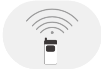
④ Wireless controlled exposure