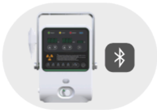
⑤ Bluetooth Support Easy connection to computer