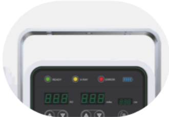
① Small and light, easy to use portable