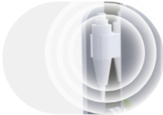
③ Wired manual exposure