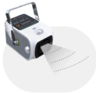
⑥ Ultrasonic ranging