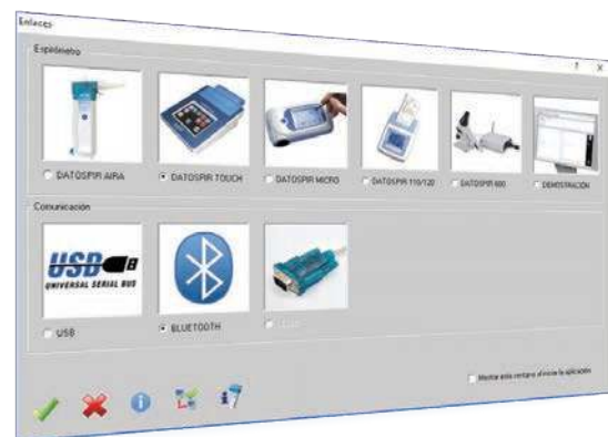
Compatible with all Sibelmed spirometers